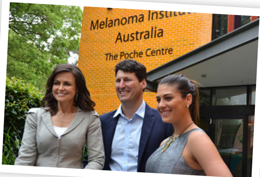
MIA Ambassadors - (L-R) Lisa Wilkinson, John Eales and Stephanie Rice